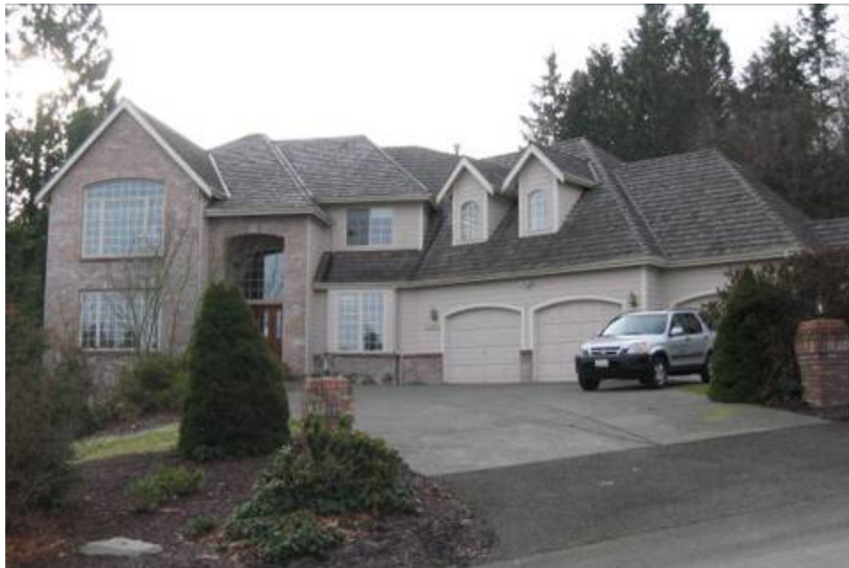
Front View of Inspected Home (Front Faces North)